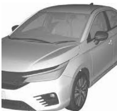
Figure City 5th generation - 2022

CITY 2017-2021.pdf , Honda Motor Co., Ltd. reserves the right, however, to discontinue or change specifications or design at any time without notice and without incurring any ... Quick Reference Guide P. 4. Safe Driving P. 31. Instrument Panel P. 89. Controls P. 109. Features P. 189. Driving P. 311. Maintenance P. 355. Handling the ... honda.com/my/manuals/CITY 2017-2021 pdf