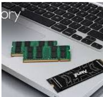
Figure Installation Help - Memory / RAM / SSD Installation Guides ...

What is the maximum RAM capacity of Acer Aspire 4720z?