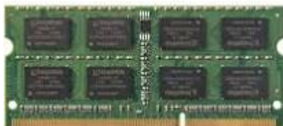
Figure Acer Aspire Notebook ES1-311 8GB DDR3 PC3-12800 1600MHz 204-pin SODIMM

Acer Aspire Notebook 5733Z-4851 Compatible Memory / RAM Upgrades , Acer Aspire Notebook User Manual. Support. Visit our Help Centre for installation guides and FAQs; Extensive, fast & professional support - Help is here ... 250,000+ businesses use Mr Memory for their Memory/RAM & SSD upgrades; Our customers trust us with all their Memory/RAM & SSD upgrade requirements; Free ... mrmemory.co.uk/memory-ram-upgrades/acer/aspire-notebook/5733z-4851