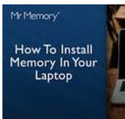
Figure Installation Help - Memory / RAM / SSD Installation Guides ...

Acer Aspire Notebook ES1-311 Memory RAM Upgrades , Acer Aspire Notebook User Manual. Support. Visit our Help Centre for installation guides and FAQs; Extensive, fast & professional support - Help is here ... 250,000+ businesses use Mr Memory for their Memory/RAM & SSD upgrades; Our customers trust us with all their Memory/RAM & SSD upgrade requirements; Free ... mrmemory.co.uk/memory-ram-upgrades/acer/aspire-notebook/es1-311?srsId=AfmBOortHaBxOgLCnGAKEhoWJIzp4H1fzcmZ7KBPq_dD7mtaFCbfaqMx